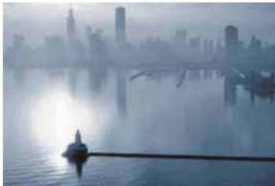
CHICAGO WATER INTAKE

and out of the basin. “Watersheds” should be defined as major river watersheds or smaller