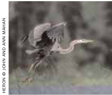
HERON