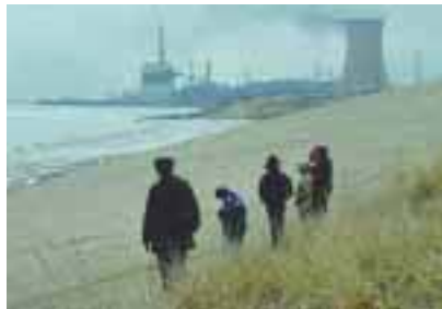
INDIANA DUNES, NATIONAL PARK SERVICE

percent, sulphur dioxide emissions by 75 percent, and nitrogen oxide emissions by 75 percent from 1999 levels. Reduce carbon dioxide emissions to 10 percent below 1990 levels by 2009