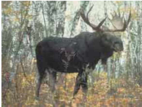
U.S. FOREST SERVICE

pathogens, and control existing terrestrial invaders